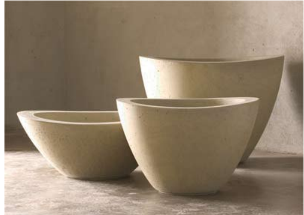
Chosen by Architectural Record as one of the outstanding products of 2005.

Note: matching Dune Trash Receptacle / Planter